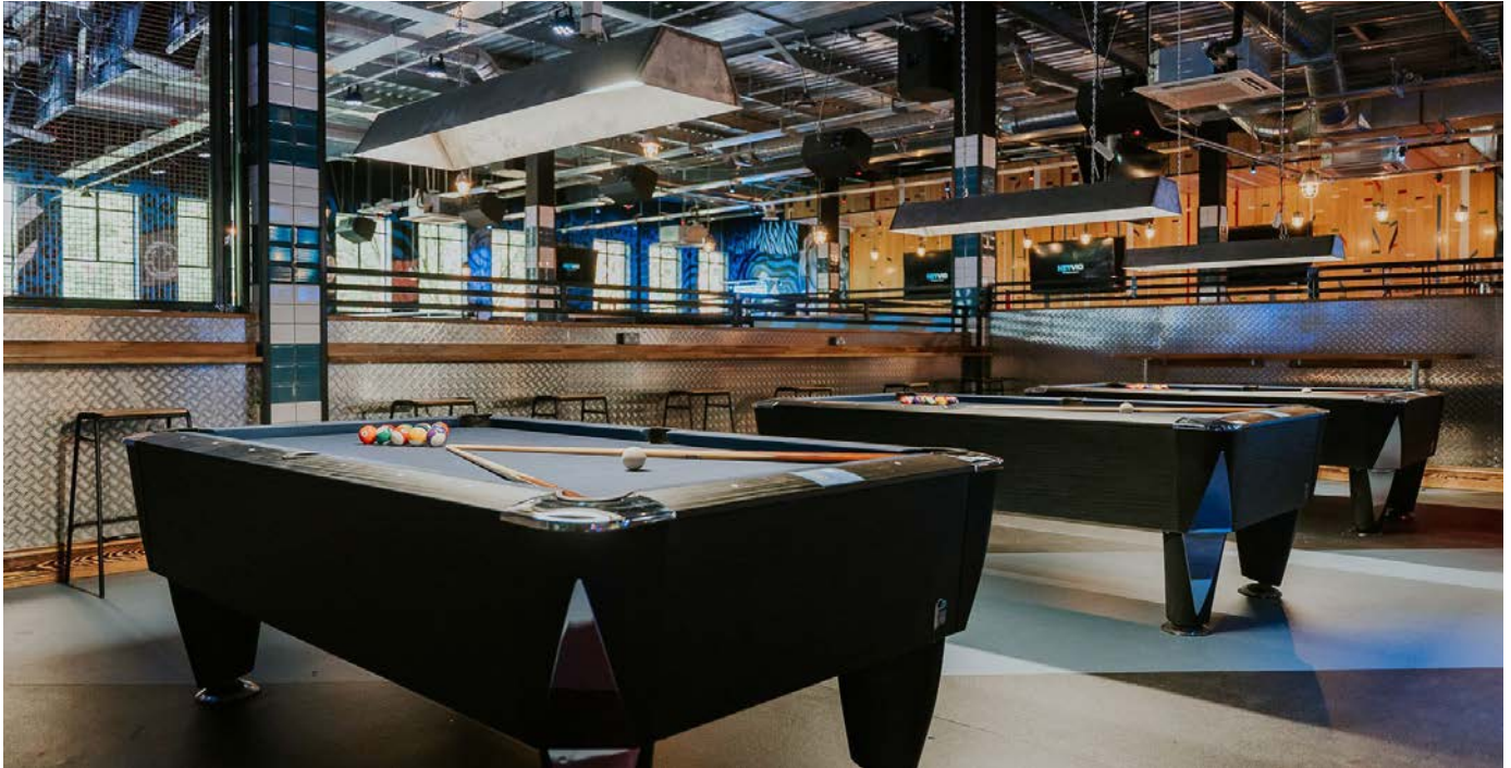
The system at Roxy Lanes involved distributing six sources, including Sky HD+ and signage players to twelve screens in six zones.