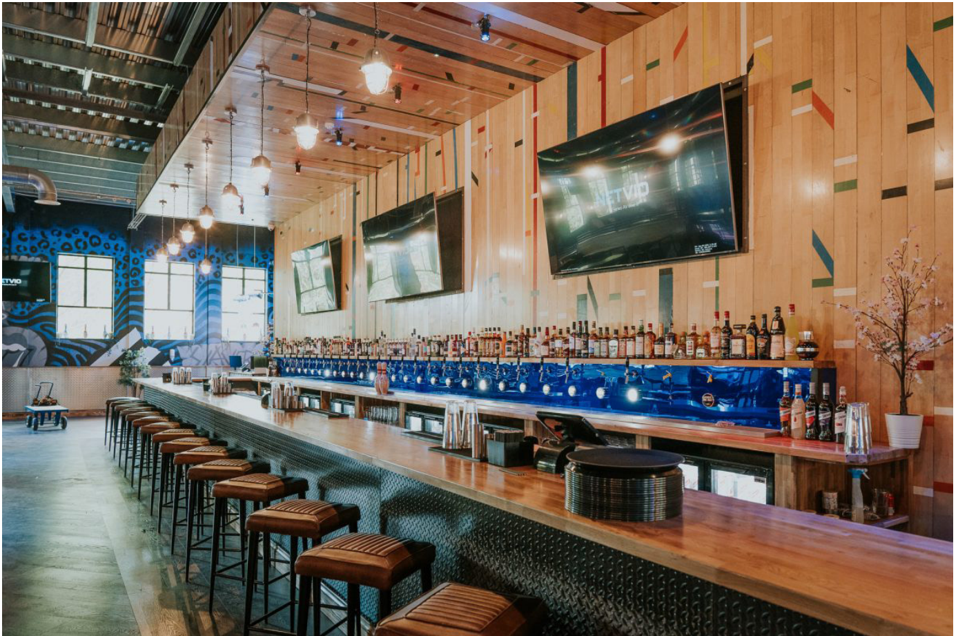
Three large displays over the bar area and nine further screens are driven and controlled by Netvio JP4 AVoIP