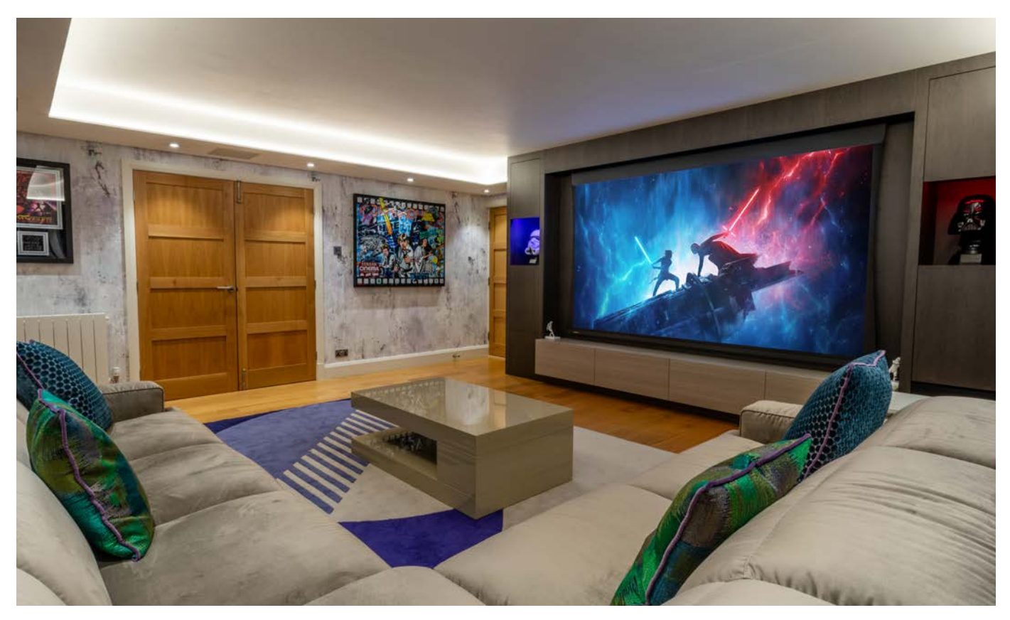
The cinema room unites beautiful interior design and custom furniture with a stunning dual-screen AV system featuring discreet 7.2 channel audio.