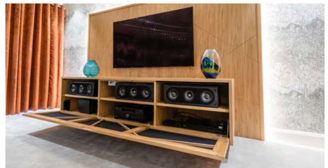
An acoustically transparent swing door conceals the audio system

“For both rooms we suggested that the speaker grilles be RAL colour-matched to the furniture but again the lady of the house surprised us by insisting that the drivers remain exposed, because she liked the look!”