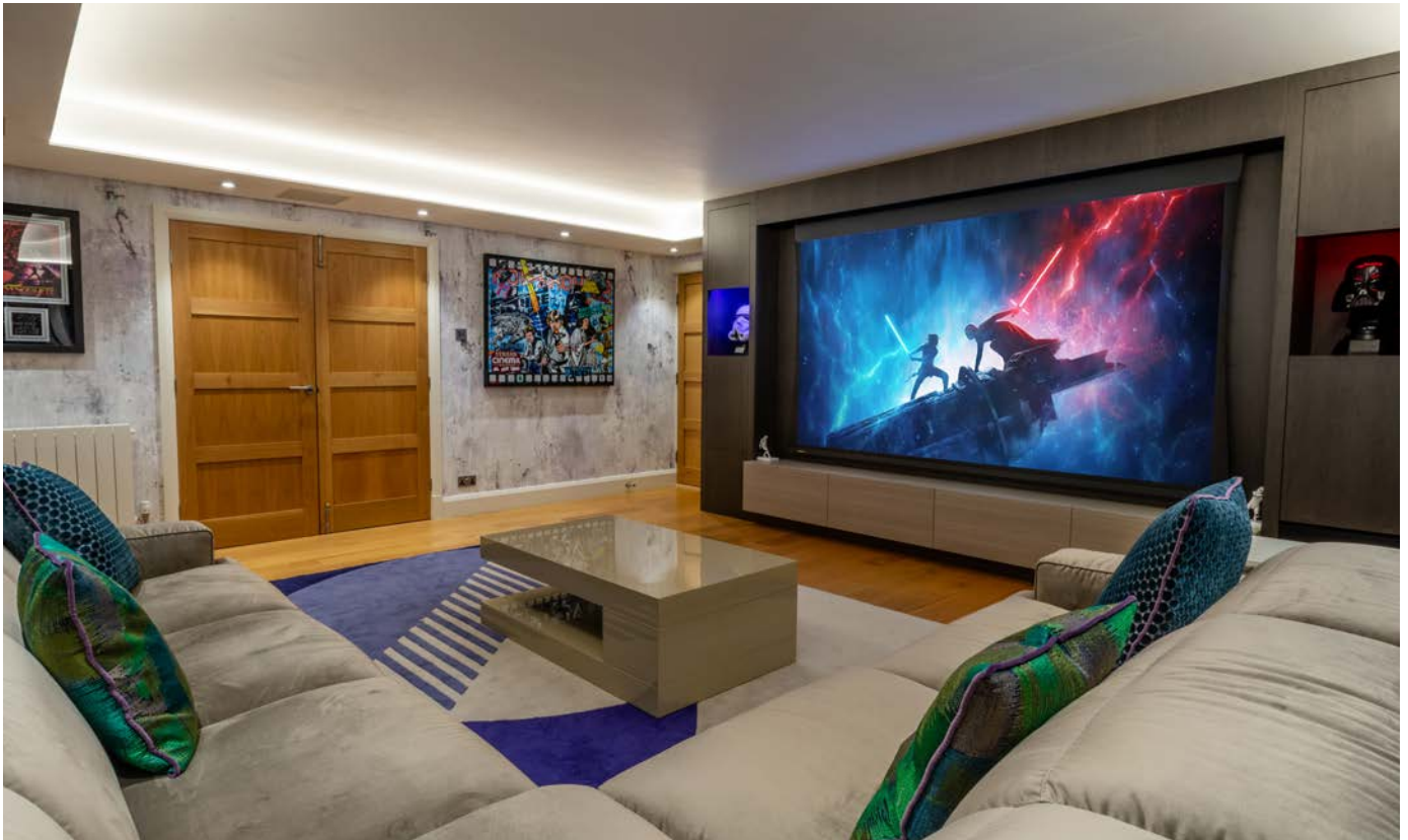
The cinema room unites beautiful interior design and custom furniture with a stunning dual-screen AV system featuring discreet 7.2 channel audio.