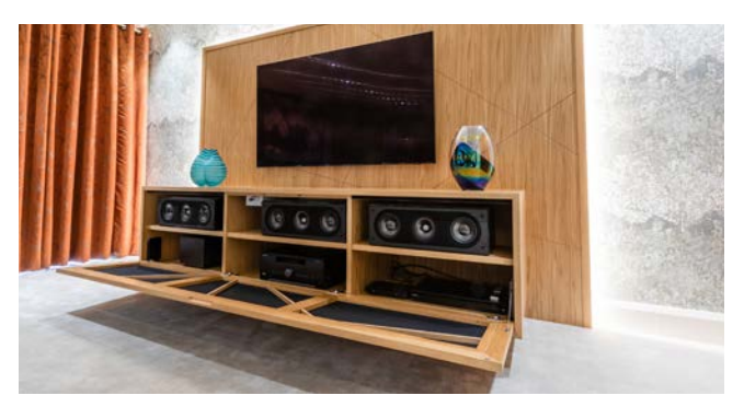
An acoustically transparent swing door conceals the audio system

"For both rooms we suggested that the speaker grilles be RAL colour-matched to the furniture but again the lady of the house surprised us by insisting that the drivers remain exposed, because she liked the look!"