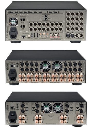
StormAudio offers up to 32ch output supported by the widest range of dynamic power options

Please contact the Habitech team for a demonstration.