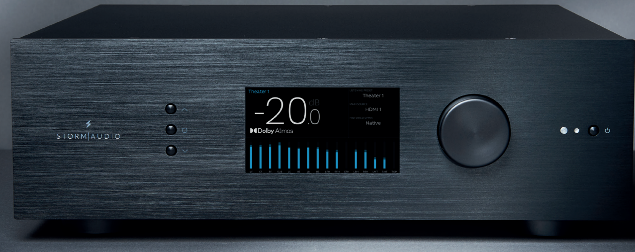
StormAudio will deliver the quintessence of what is possible in high-end home cinema