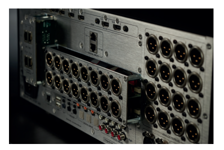
With peerless modularity you can buy what you need and upgrade when necessary to protect your investment