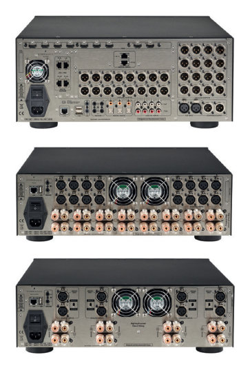
StormAudio offers up to 32ch output supported by the widest range of dynamic power options

Please contact the Habitech team for a demonstration.