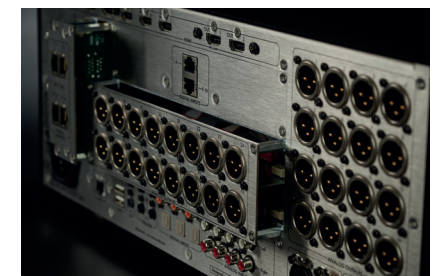
With peerless modularity you can buy what you need and upgrade when necessary to protect your investment